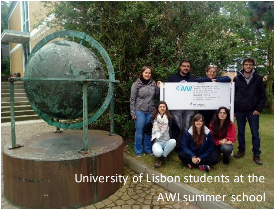
University of Lisbon students at the AWI summer school