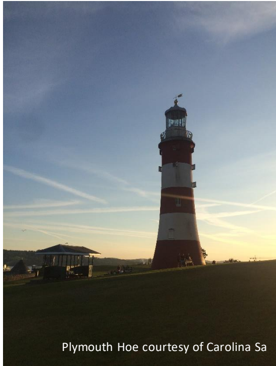
Plymouth Hoe

16 young scientists from 9 nations visited the North Sea island Helgoland for 11 days to deepen their knowledge of coastal phytoplankton research focusing on observations and industrial applications. Among them were seven students from the University Lisbon funded by PORTWIMS. The summer school combined theoretical training with hands-on practical sessions on the research vessel Heincke ( read more ).